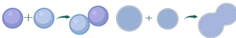
Fig. 1 Coagulation mechanism (left). Fusion mechanism (right)

The main difference between (1.1) and the standard one-dimensional coagulation model is the presence of the term \partial_a[r(a, v)(c_0 v^{\frac{2}{3}} - a)f(a, v, t)] . We call \partial_a[r(a, v)(c_0 v^{\frac{2}{3}} - a)f(a, v, t)] the "fusion term". This describes an evolution of the particles towards a spherical shape (see Figure 1). The dynamics generated by this term preserves the total number and volume of the particles. The term c_0 v^{\frac{2}{3}} - a indicates that the area of the particles tends to be reduced as long as it is larger than that of a sphere c_0 v^{\frac{2}{3}} . In particular, spherical particles remain spherical and they do not evolve at all due to the fusion term. This fusion mechanism holds, for example, for the merging of droplets consisting of highly viscous fluids (see [14]).