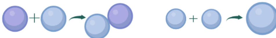
Fig. 2 Absence of fusion (left). Instantaneous fusion (right)

Additionally, r(a, v) will indicate the fusion rate and describes how quickly the particles evolve towards the spherical shape and thus has units of the inverse of the fusion time. In the particular case when r \equiv 0 , fusion does not occur and particles attach at contact points forming a ramified-like system in time. On the contrary, if the fusion rate is much faster than the coagulation rate, the particles tend to become spherical immediately after colliding (see Figure 2). A distinction between these two cases is not possible in the standard one-dimensional model.