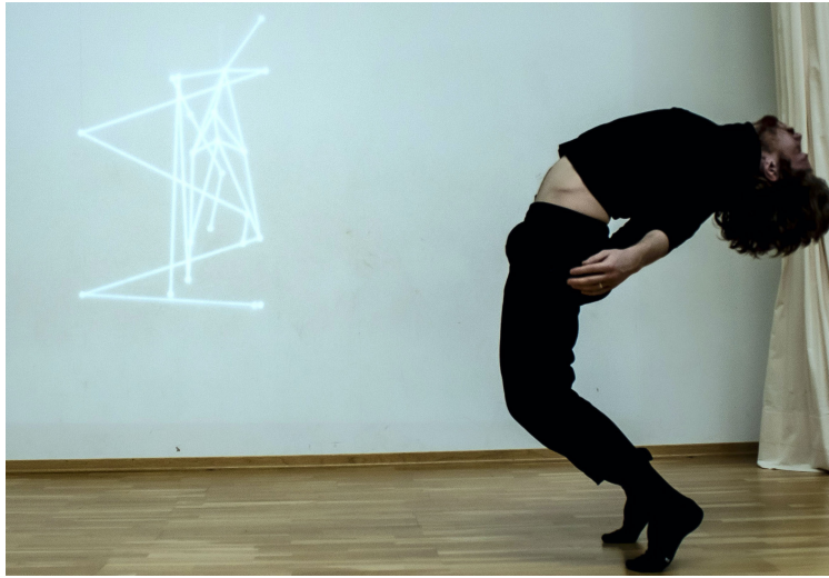
Fig. 1. A dancer and choreographer exploring the glitch