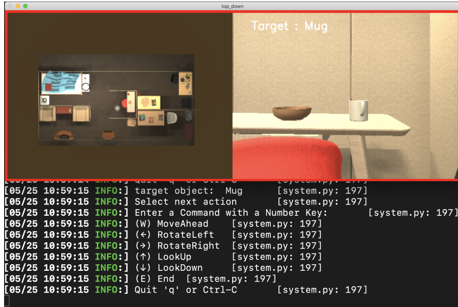
Figure 4: Human Trial Interface for ASK4HELP.

We modified AI2-THOR [27] to run custom actions that are intercepted and resolved in python before reaching unity. In unison, we modified AllenAct to allow standard input from the terminal and built a simple interface by customizing THOR's terminal interfacing tools, to display the agent's view of the scene and take user choices for actions to send them back to the model.