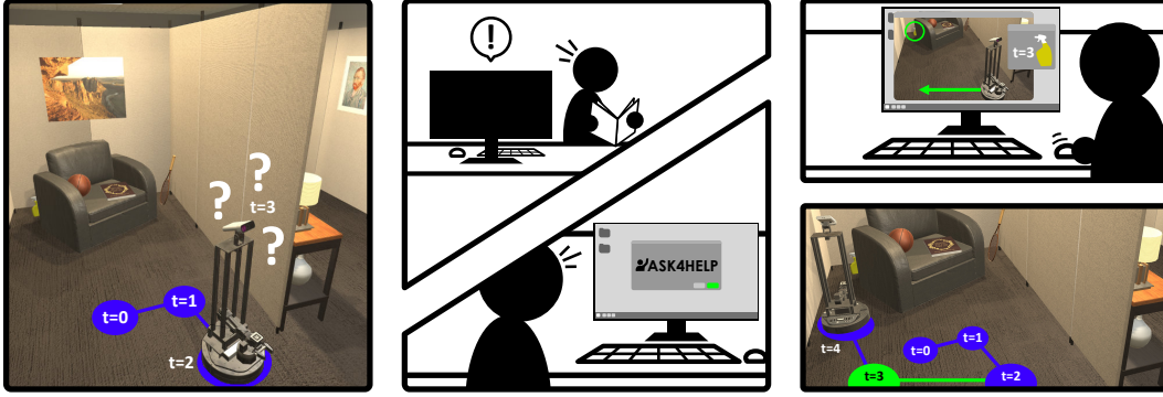
Figure 1: Learning to ask for help (ASK4HELP) . Left : An agent struggles to find a spray bottle. Middle : The ASK4HELP policy recognizes this confusion and requests help from a human. Right : The human provides help at time t = 3 , which puts the agent on the right path and it succeeds.

below 10% 4 . In addition, these models often tend to get stuck, take repetitive actions and even collide with furniture and walls as they move around in a scene. Deploying such agents in the real world can be costly, slow, and frustrating for users. In safety-critical situations such as rescue or reconnaissance operations, such failures can be even more expensive. While future modeling improvements may alleviate these concerns somewhat, we are still a ways away from creating agents that can perform household tasks robustly and safely.