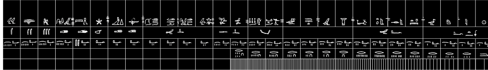
Figure 1: Ancient Egyptian Cubit Rod for measuring length. One of the earliest known objects for standardized measurement. Turin Museum, Wikimedia Commons, CC BY-SA 3.0