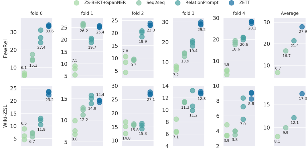
Figure 3: Results of each data fold in the single-triplet setting with m=10 . We experiment on three different random seeds. Each point is the accuracy (%) of each evaluation and labeled numbers are an average of three results. Final column shows average over all folds.