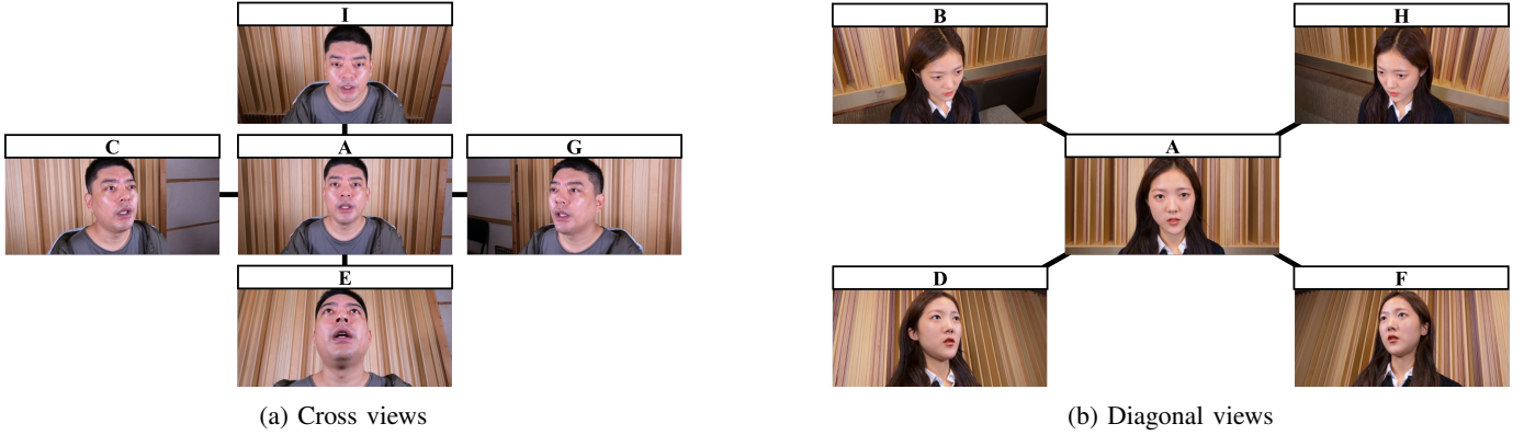
Fig. 1: Video samples from the OLKAVS dataset. 5 different views were synchronously recorded for each recording session. (a) and (b) show two types of views and denote their labels. The amount of data with view "A" doubles than the others because the view is common in both recording sessions.