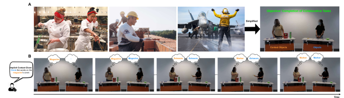
Fig. 1: (A) Real-world examples of collaborative tasks that require belief inference via nonverbal communication. (B) Example of instructions provided during data collection.

Gaze360 [7] to collect 3D human gazes, and OpenPose [8] to obtain all the critical points for posture estimation.