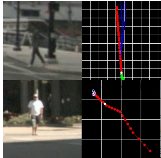
Fig. 4: Examples of observed appearance data, along with ground-truth (past - green, future - red, white - prediction point) and multimodal predicted (blue) trajectory data. Top: successful case of motion initiation prediction. Bottom: example demonstrating limitations of source data. Ground-truth trajectory (red) shows motion while pedestrian is still stationary, and pre-empt's motion before it occurs, for example due to bidirectional filtering over time.

In order to operate an autonomous vehicle in the vicinity of pedestrians, it is important to be able to estimate their future motion, and to identify significant cases such as changes of motion, which can indicate when they may enter the road