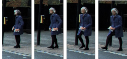
Fig. 1: Example of cropped pedestrian appearance, showing gait change with motion initiation

Existing methods predict future motion based on an observed history of positions. A significant limitation of these approaches is that when changes of motion take place, such as initiation of motion to enter a road area from a stationary position, there is a delay before the motion can be accurately observed in the trajectory, and used to make an accurate prediction. Noise is present in the estimated position, and the greater the noise the later that motion initiation can be reliably observed. Appearance cues such as changes of body pose provide additional information about pedestrian actions, such as gait changes when pedestrians begin or stop