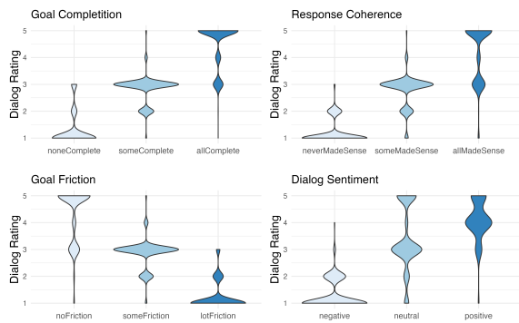
Figure 2: Distribution of dialog ratings with salient attributes of dialog.

In Figure 2 we plot the distribution of dialog-level rating against four salient attributes of the dialog. As expected we can clearly see that dialogs received higher ratings when users successfully completed their goals, system responses were coherent, and users encountered less friction while progressing towards their goals. Further, Table 1 computes the Spearman’s \rho correlation between the ratings and attributes. Goal completion was found to have the highest correlation score of .859, while user sentiment had the lowest, at .449. Moreover, user friction encountered had a negative correlation to dialog rating. These observations are intuitive given the dialogs were sampled from mostly task-oriented experiences.