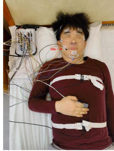
Figure 1: Diagram of the patient's face frame of PSG and location of the microphone in the sleep medicine research center. Sensors attached to the patient's face and body are part of the PSG acquisition system.

A standard full PSG simultaneously records more than 10 physiologic signals during sleep, including electroencephalogram (EEG), electrooculogram (EOG), electromyogram (EMG), body position, video recording and et al. For recorded PSG data of each patient in the SSBPR dataset, sleep stages were scored by three experienced experts according to the AASM Manual V2.6 [20]. A certified technician performed the first level of scoring, and the final level was conducted by two certified doctors who verified the scoring of PSG. Both of them got RPSGT (Registered Polysomnographic Technologist) certified. Comumedics Profusion Sleeps was used to record the data, display