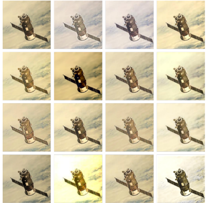
Fig. 2. A visual comparison of URes34P (bottom right corner) to existing DL image enhancement solutions referenced in [36]. From top left to bottom right: Input, Zero-DCE, Zero-DCE++, LightenNet, EnlightenGAN, MBLEN, KinD, DRBN, Retinex-Net, RRDNet, TBEFN, LLNet, ExCNet, DSLR, KinD++, URes34P.