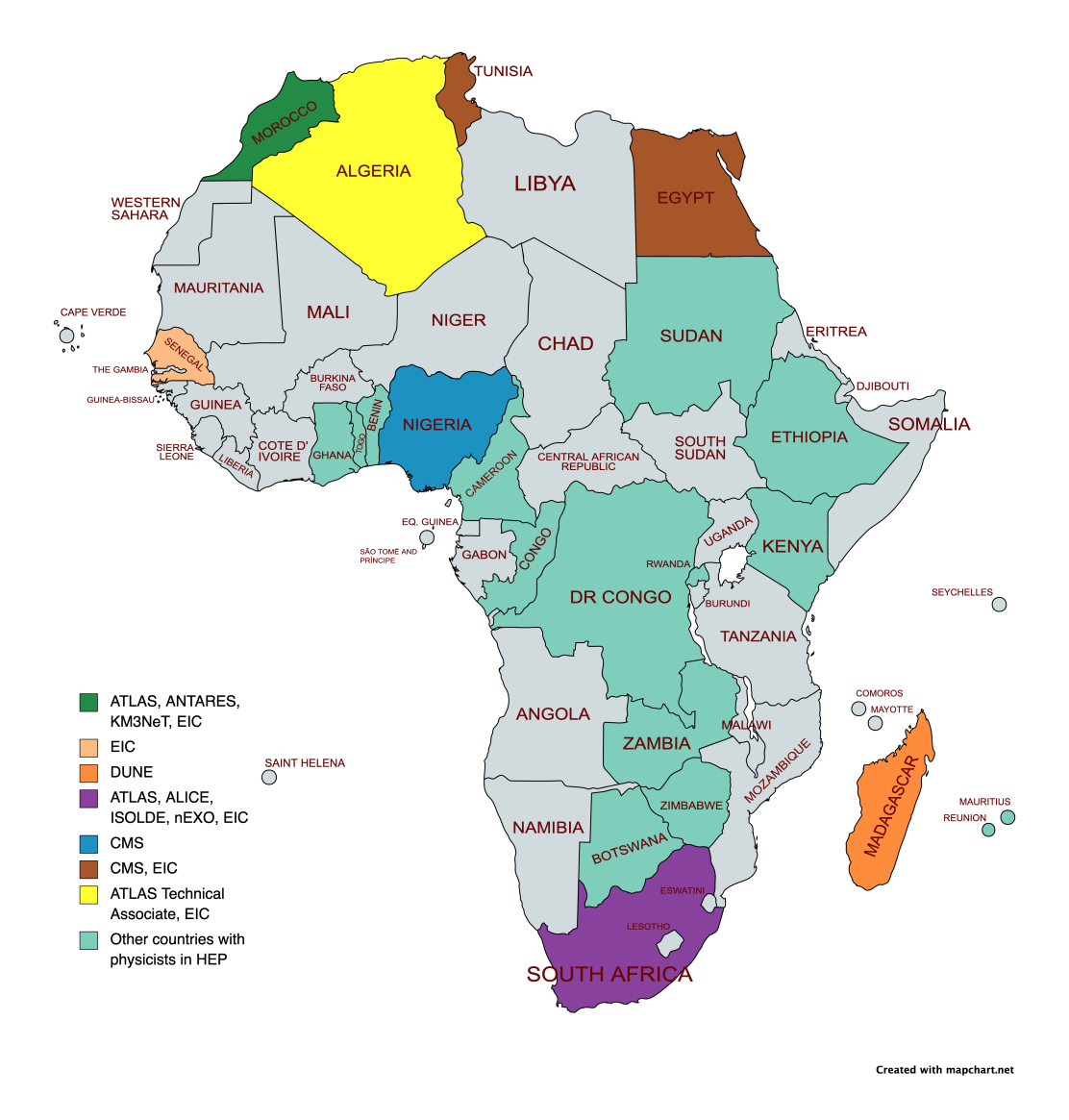
Figure 1: African countries with formal programs or citizen in high energy physics.