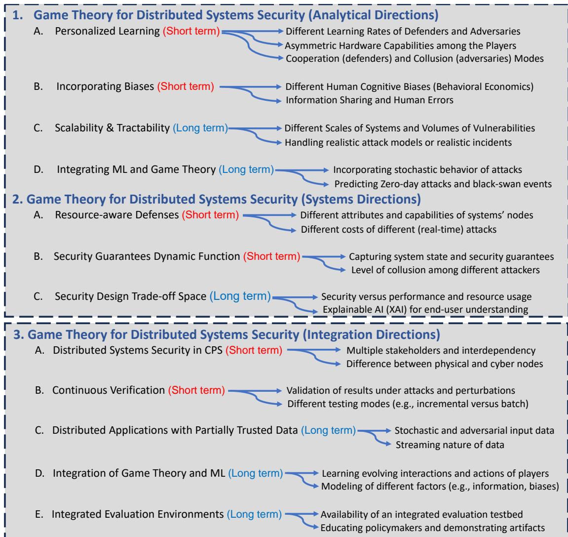
Figure 3. A timeline overview of research challenges and future research directions for both of analytical side and systems side (upper part), along with possible research directions of integrating both sides (lower part).

was supported by the Army Research Lab (ARL) under Contract No. W911NF-2020-221 and National Science Foundation under grants CNS-202667, CNS-2134076, and CNS-2038986. Any opinions, findings, and conclusions expressed in this material are those of the authors and do not necessarily reflect the views of the sponsors.