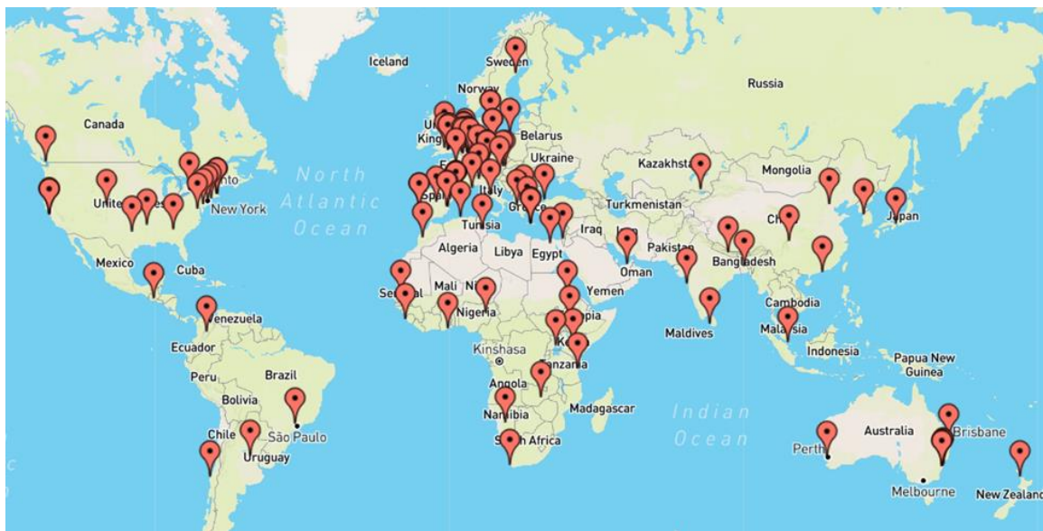
Figure 1 – Geographical distribution of the multi-disciplinary experts.

In other initiatives, the World Health Organisation published a report focused on key ethical and legal challenges and considerations. As it was intended for health ministries and governmental agencies, it did not explore the technical and clinical aspects of trustworthy AI (23). Likewise, Europe's High-Level Expert Group on Artificial Intelligence established a comprehensive self-assessment checklist for AI developers. However, it covered AI in general and did not address the unique risks and challenges of AI in medicine and healthcare (24).