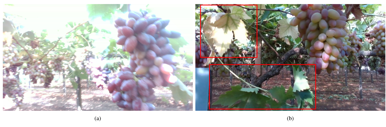
Fig. 4: Example of difficult cases present in the experimental field. Strong frontal illumination and motion blur due to fast motion (a), and occlusions due to leafs and branches (b).

in the x and y directions, while the scale and rotation components (a_{11},a_{12},a_{21},a_{22}) can indicate changes in scale and rotation.