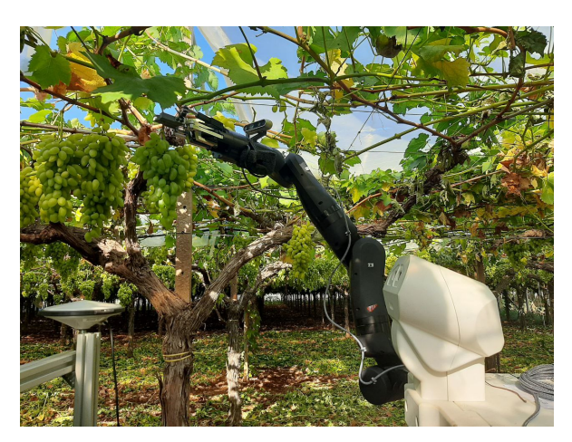
Fig. 1: Agricultural robotic platform used in the EU Project CANOPIES for operations in table grape vineyards, equipped with an Intel RealSense d435i camera on the wrist. AgriSORT is implemented on this robot, and is used for tracking grapes.

This work has been partially supported by Sapienza University of Rome as part of the work for project H&M: Hyperspectral and Multispectral Fruit Sugar Content Estimation for Robot Harvesting Operations in Difficult Environments. Del. SA n.36/2022.