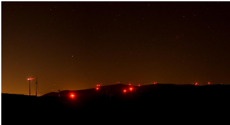
Fig. 1. Nighttime landscape with wind farm obstruction lights in Miranda do Corvo, Serra da Lousã, Portugal ( 40^{\circ}02'42.98''\text{N} , 8^{\circ}16'30.84''\text{W} ).

The visual landscape degradation produced by wind farms has been evaluated mostly for daytime, based on turbine visibility estimates (limited by the contrast luminance thresholds in daylight) combined with different spatial aggregation metrics (see e.g. Hurtado et al, 2004; Kokologos et al, 2014). Comparatively less attention has been given to the deleterious effects of wind farm lights on the nighttime landscape (Fig. 1). The nightscape is an essential element of the human experience, whose cultural, social, scientific, and aesthetic values are assets of the intangible heritage of humankind (Marín and Jafari, 2008). As set forth by the Natural Sounds and Night Skies Division of the USA National Parks Service "a naturally dark night sky is more than a scenic canvas; it is part of a complex ecosystem that supports both natural and cultural resources" (NPS, 2021). Borrowing from Rich and Longcore (2006) on conservation planning, it can certainly be said that daytime landscapes are "only half the story—the daytime story".