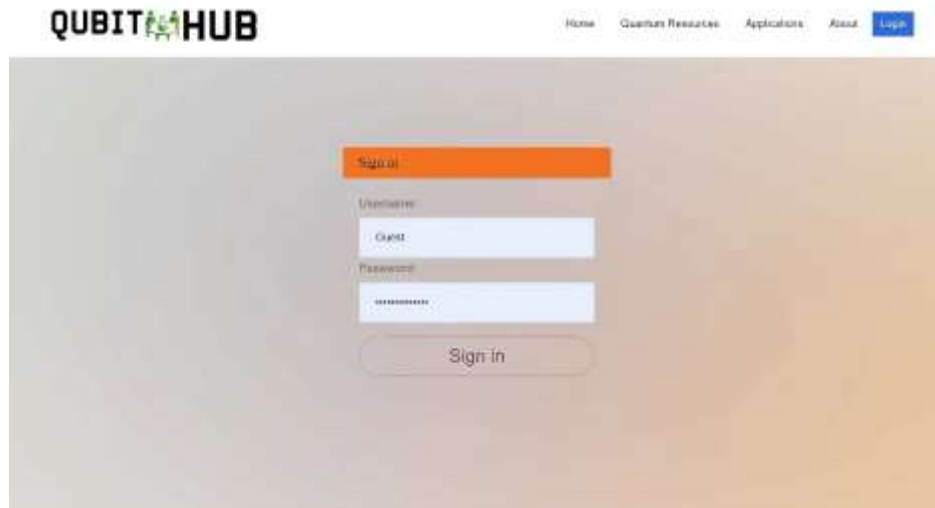
Figure 1 displays a screenshot of a user account profile within the Qubithub portal.

The third option involves using our website platform called Qubithub.org ( https://qubithub.org/ ), which offers a user-friendly environment for executing Qinterpreter online. By visiting the Login page, as shown in Figure 1.