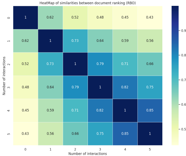
Figure 2: Passages ranking similarity between interaction turn. Ranked Biased Overlap (RBO) metric (p=0.9). Interaction 0 corresponds to the document ranking using Bm25 + MonoT5

RBO measures the similarity between incomplete and non-conjoint rankings and also values more heavily top ranked document. The more diverse the rankings, the lower the score. Figure 2 shows the ranking similarity for each additional user feedback. We can observe that the ranking seems to stabilize with the number of interactions: the similarity is higher between 4 and 5 interactions than between 0 and 1 interactions.