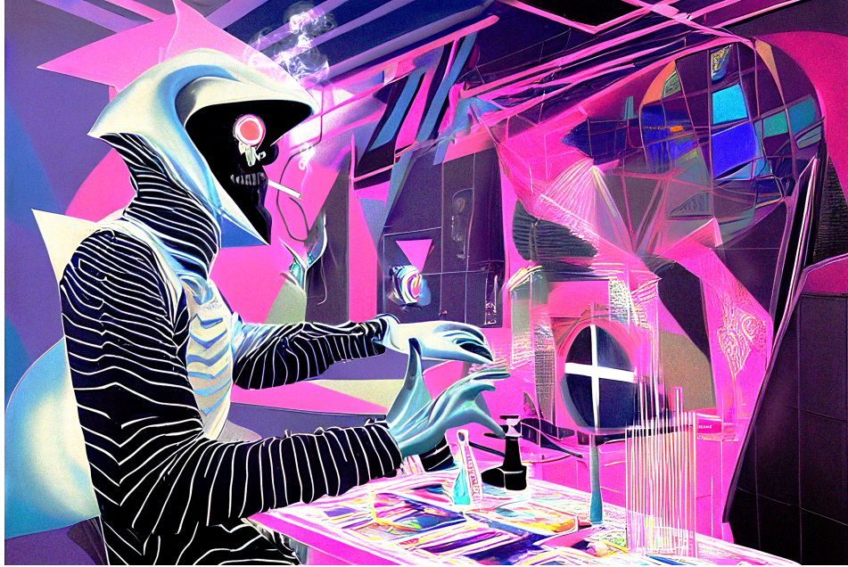
Figure 2: Answer to the question “What do you call this activity?”. (Promptmancer, by feddie xtzech - https://objkt.com/asset/KT1EEMp7Z2Dk2vKGYLYuJJiJgTdNSzsnGUyd/0 )

The curiosity can be fun-related, but also driven by more serious deliberations and existential reflections: