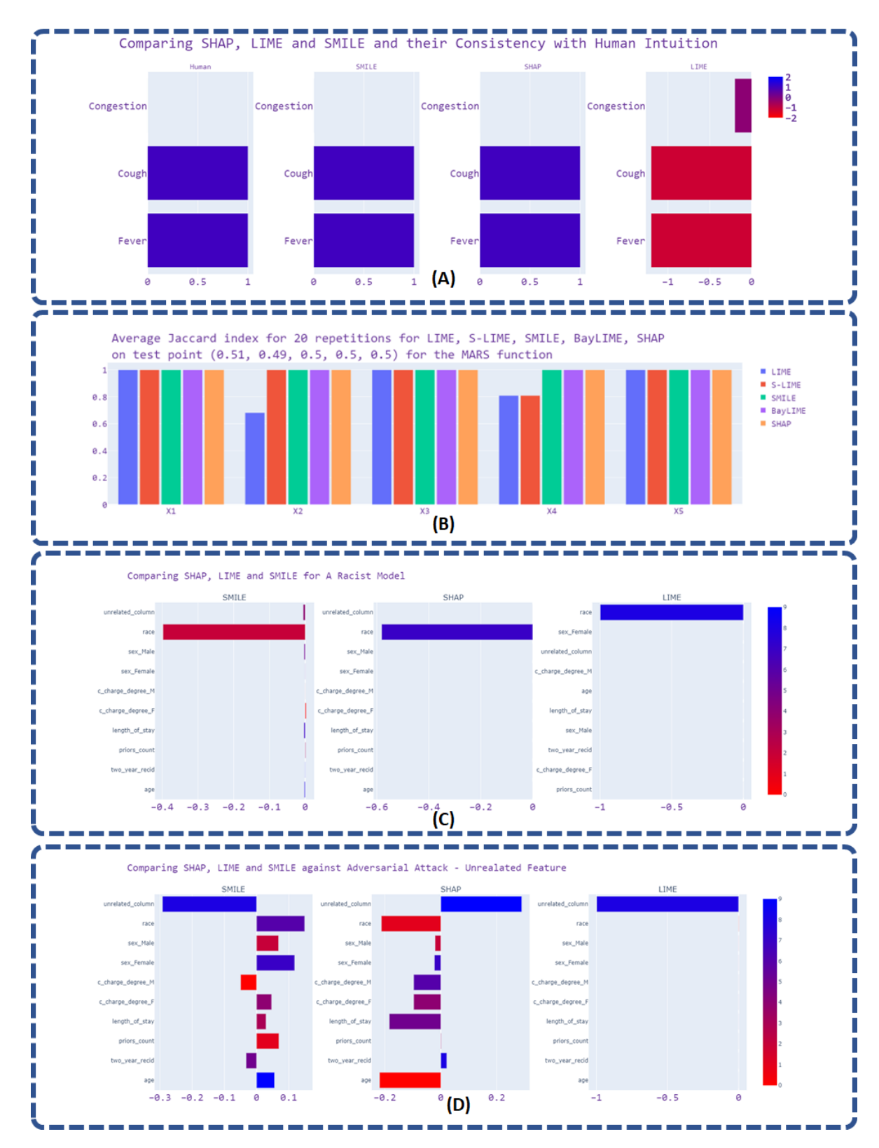
Figure 2: Comparing SHAP, LIME and SMILE (A) and their Consistency with Human Intuition (Adapted from Lundberg & Lee (2017) and compared with SMILE), (B) COMPAS Dataset and XgBoost Model without Adversarial Attack, (C) against Adversarial Attack and a Racist Model, (D) against Adversarial Attack and a Model with Unrelated Feature [X-AXIS are Explainability Values]