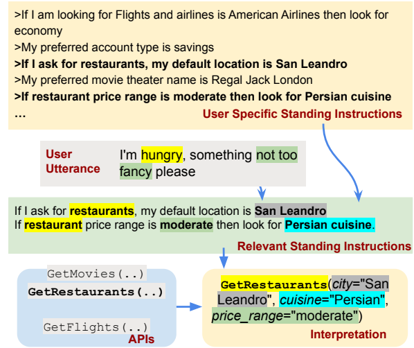
Figure 1: Parsing an utterance into a structured output, in the presence of a user-specific set of standing instructions . A model for the task needs to identify (explicitly or implicitly) the subset of instructions applicable to the utterance and interpret the utterance into API calls.

to users. For example, ChatGPT allows several external plugins such as OpenTable for searching and reserving restaurants or booking travel through Expedia. 2 These applications must learn to identify which service the user is seeking while respecting preferences across diverse domains that are unique to each user. Understanding such preferences can aid in personalising the user experience by providing tailored responses, increased accuracy in recommendations and saving user time. However, in most cases, users must verbalise their preferences in detail during the interaction, including for repeated requests.