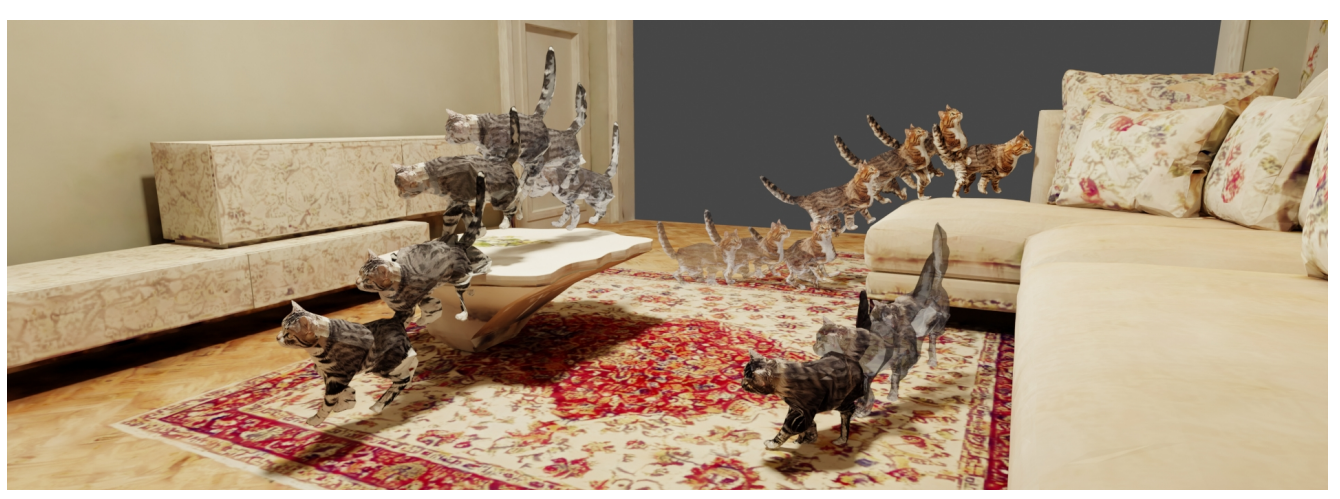
Figure 1. Virtual Pets. Given a 3D scene, we can generate diverse 3D animal motion sequences that are environment-aware.