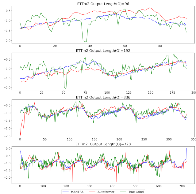
Fig. 3. Visualization of MANTRA prediction compared to actual label on ETTm dataset

numerical results significantly in both the ETT dataset and the ILI dataset. The URT layer allows fast adaptations of new patterns because base models can be frozen while only updating a few parameters of the URT layer. On the other hand, the slow learner contributes positively to the overall performance of MANTRA where its absence deteriorates the numerical results of MANTRA. In the ETT dataset, its effect is not obvious for small predictive lengths but becomes clear with the increase in predictive length. In the ILI dataset, MANTRA's performances are compromised due to the absence of the slow learner for all cases. This fact confirms the efficacy of the extended dual network concept which decouples the representation learning and the discriminative learning. The slow learner trained in a self-supervised manner is capable of