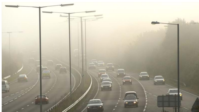
Fig. 4. Another sample foggy image from target domain.

Table II presents a comparative analysis between the nature and accuracy outcomes of the proposed method and the existing techniques on foggy image dataset. The table indicates the accuracy of roughly 85% of the proposed method, which represents a notable increase over the existing techniques based on FerRCNNs. The proposed method outperforms the existing techniques due to significant effort on domain