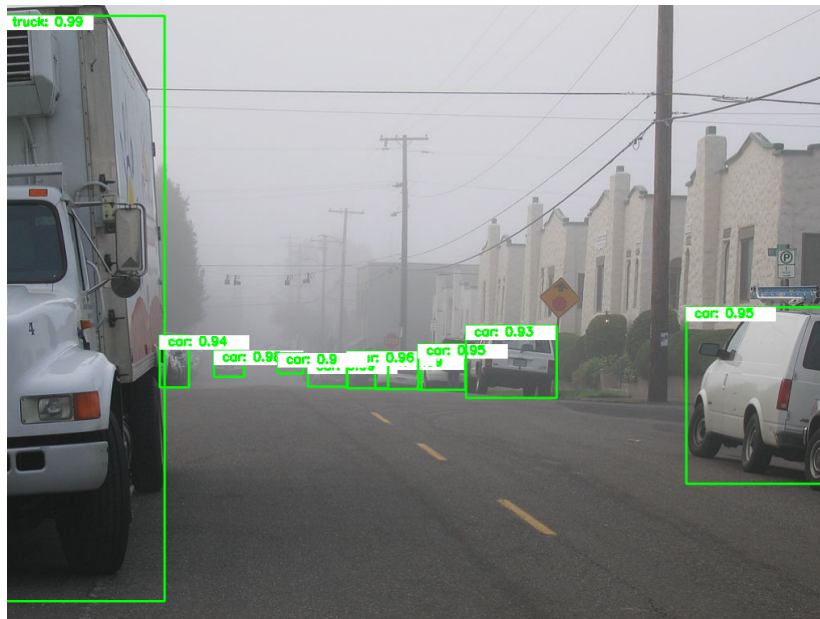
Fig. 3. Object detection in image of Fig. 2 by the proposed method.

For training and testing purposes, the hardware requirement encapsulates processor speed of 3GHz, 16GB memory working at 3200MHz, GPU supporting CUDA at 1GHz. The thermal throttling curves have been modified in accordance with the proposed method's hardware requirements.