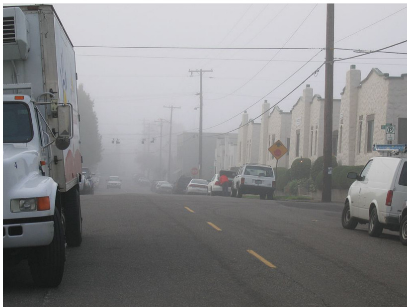
Fig. 2. A sample foggy image from target domain.