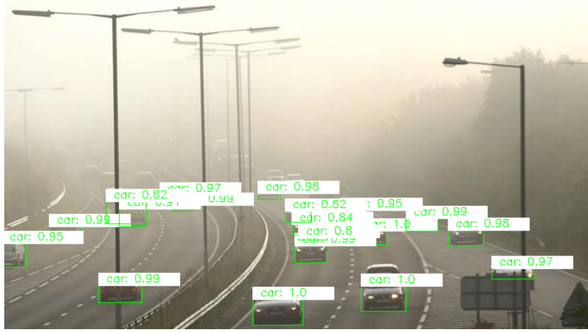
Fig. 5. Object detection in image of Fig. 4 by the proposed method.