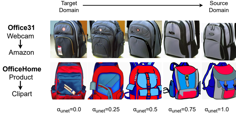
Figure 2: Visualization of the diffusion-based domain mixup for Unsupervised Domain Adaptation.