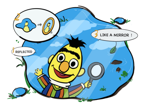
Figure 1: Sketch Map of the Metaphorical Language Writing Process.

With the progression of computational linguistics, there is an increasing focus on metaphor gen-