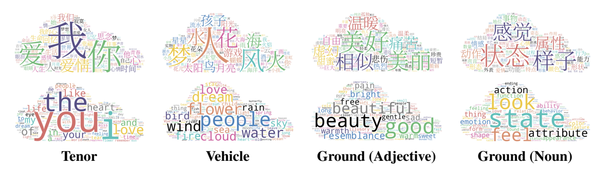
Figure 2: Word Clouds of tenors, vehicles, and adjective and noun components of grounds; the corresponding English word clouds are in the lower row.

tion quality, which mandates that each data piece is assessed by at least three annotators, improving label consistency and accuracy. Our labeling strategy emphasizes sophisticated composition of our GROUND labels, ensuring a structure combining an Adjective and a Noun (形容词 + 名词). The noun part delineates the shared characteristic between the TENOR and VEHICLE, while the adjective highlights the dimension underscoring their connection. Fig. 2 showcases the diverse adjectives and noun elements of our annotated grounds via word clouds.