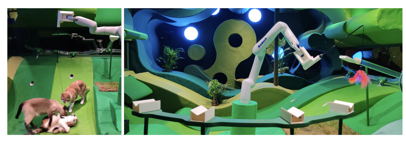
Figure 1: The the three cats (Clover, Pumpkin, and Ghostbuster) playing with a toy (left) and the robot arm lifting the feather helicopter toy from the rack (right)

the artists fielding many questions, but nothing to suggest an outcry or backlash against the project.