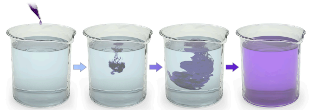
FIG. 1. A drop of dye is dripped into a solvent, dispersing through the vessel until it is evenly spread across it. Credit: Bruce Blaus 1

For the sake of clarity and simplicity, I will specifically address the case where a single mechanical force acts on the system, such as the diffusion of a dye in a solvent, as depicted in Fig. 1. Here, the conserved quantity is represented by the number ( N ) of dye molecules, whose density is denoted by n and current density by \mathbf{j} . If diffusion takes place at