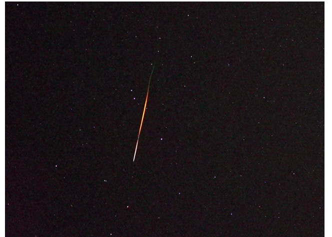
Figure 1 – The brightest Tau Her meteor detected by us on the 31st of May 2022. We estimated its brightness to be -2 magnitudes as it passed through Corvus.

This year, we present a continuation of our efforts, expanding upon the initial findings and offering a more comprehensive analysis of the Tau Herculids. Our observations have yielded a population index of r = 5.56 \pm 1.83 , a figure that stands out when compared to other published values. This discrepancy, we hypothesize, could be attributed to the heightened sensitivity of our observational equipment, particularly adept at detecting fainter meteors. Furthermore, we have refined our measurements of the radiant position of the meteor shower for the mid-time of our observations.