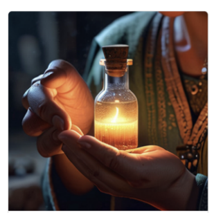
The villagers are often wary of Eira due to her magical prowess, but they tolerate her, as she provides mystical remedies for their ailments using her rudimentary magic.