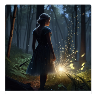
Eira's life is defined by a struggle to control the erratic and often unpredictable surge of her magic, leaving her seeking solitude in the outskirts of the village.