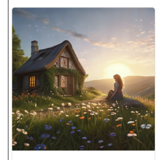
Eira, an untested young sorceress living in a small village, spends her days practicing small charms and illusions, under the watchful eye of her elderly grandmother, her only family.