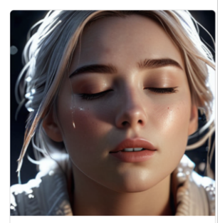
Despite her solitary life and struggle to control her powers, Eira dreams of honing her skills and understanding the true nature of her magic.