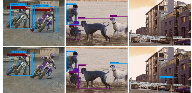
Fig. 1. Scenarios in our invisible backdoor attack. The columns categorize the different attack scenarios: the first column for ODA, the second for OMA, and the third for OGA. The first row demonstrates model predictions without backdoor triggers, whereas the second row lists predictions with the insertion of our invisible triggers specific to each scenario.

Object detection is a critical component of various real-world applications, such as autonomous driving and surveillance, and significant advances have been made owing to deep neural networks (DNNs). However, recent studies have shown that DNNs are vulnerable to backdoor attacks [1][2][3]. Backdoor attacks aim to stealthily insert a backdoor into a model using various manipulations during training. In such an attack, the model performs similarly to a normal model when no backdoor trigger is encountered; however, when the backdoor trigger appears in the inputs, the model performs a predetermined behavior.