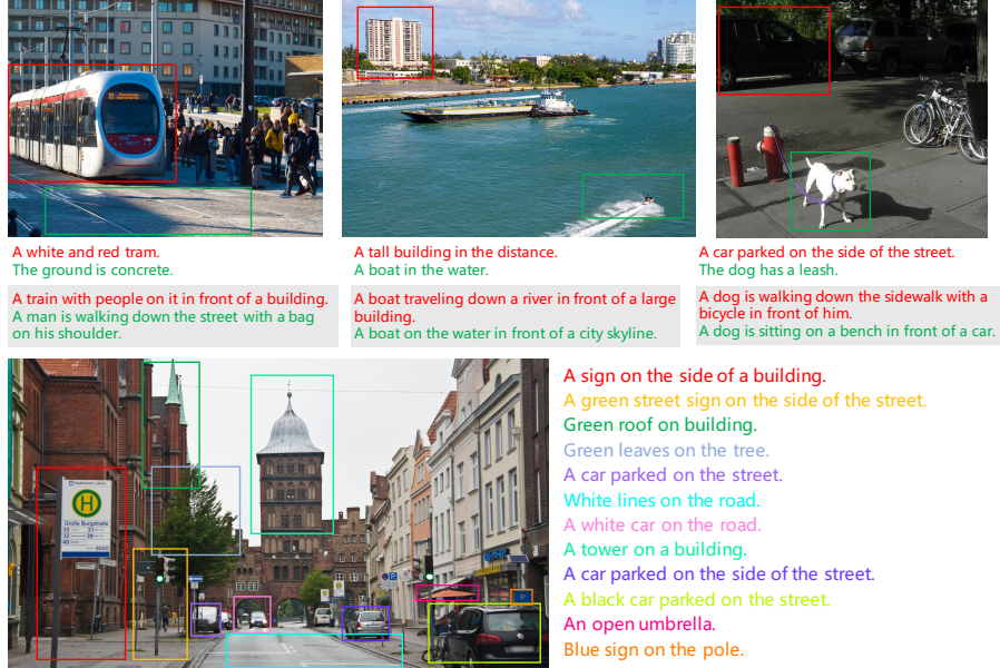
Figure 2: Visualization of fine-grained description generation. This figure shows the captioning results of using region features from the visual feature map as input. The text in the same color as the bounding box in the figure is the description of the corresponding area. Text on a gray background indicates results without region description data.