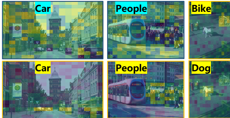
Figure 3: Visualization of fine-grained image-text retrieval. This figure shows the similarity between the visual feature map and the text feature at two stages. The blue borders and undertones represent the result from the pre-training stage one, and yellow borders and undertones illustrate the results of stage two. The text superimposed on the image corresponds to the input text.

To study issue a. , we compare MM-GEM trained at two stages by showing the similarities between visual feature maps and several given text queries. For the stage-one model, we calculate the cosine similarities between normalized visual features output by h_1 and text features output by h_2 . For the stage-two model, we alter visual features to the output of h_4 . The visualized results are demonstrated in Figure 3. The two columns on the left clearly show that stage-two model well localizes the text query to the corresponding region, while stage-one model totally fails. The rightmost column shows the stage-two model well responds to different text queries for the same image. These results show that stage-two training essentially enables the ability of fine-grained retrieval.