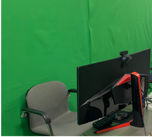
Figure 5: Recording studio setup for MultiDialog dataset

percentage of unique n-grams in the set of responses. Specifically, D-1 measures the percentage of unique unigrams in the generated text, while D-2 measures the percentage of unique bigrams.