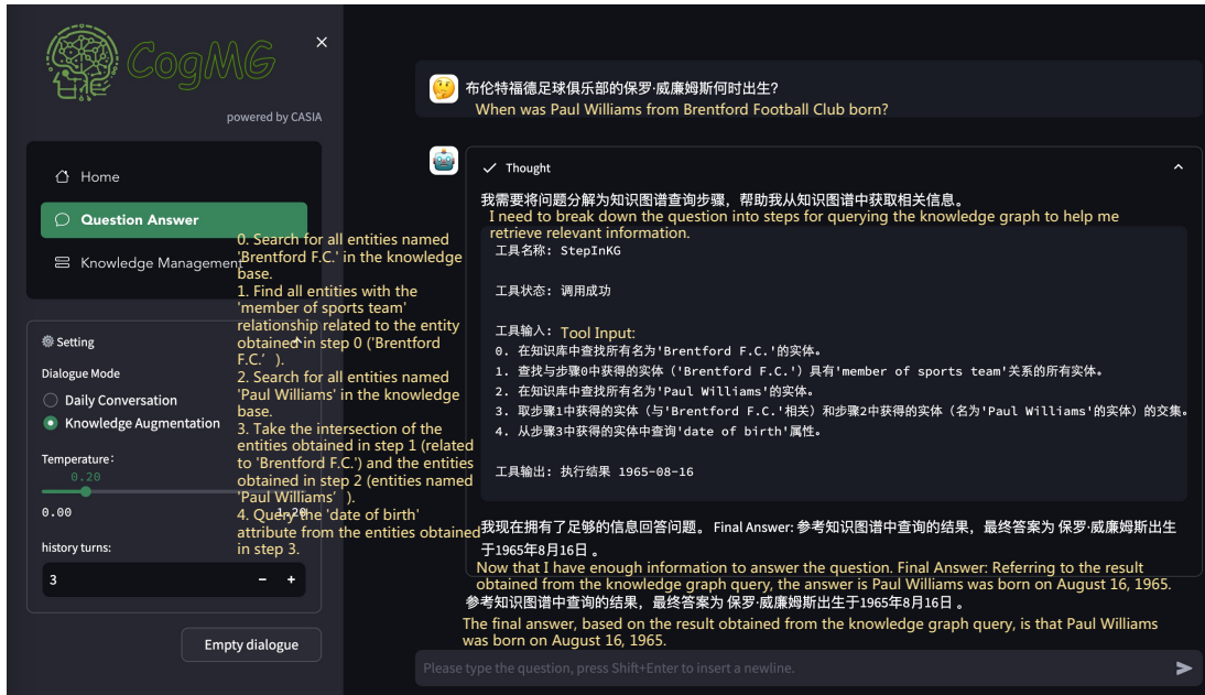
Figure 3: System screenshot.

pability of generative models. Besides end-to-end generation, Chen et al., 2021 suggested first identifying the entities and schema involved in the problem separately and then utilizing the transducer to generate logical expressions, ensuring the accuracy of logical syntax. Finally, it employs a checker to enhance the semantic consistency of the logical form. With the assistance of LLM, KB-BINDER (Li et al., 2023) generates a draft of logical expressions using codex and then matches executable programs based on BM25 scores. Thanks to in-context learning, the process can be accomplished with just a few annotated examples. Moreover, LLMs’ reasoning and planning capabilities can also serve as better assistants for utilizing knowledge graphs without additional training (Jiang et al., 2023a; Sun et al., 2023; Jiang et al., 2024; Liu et al., 2024b). However, these works mainly focus on answering questions within the confines of a given dataset without addressing scenarios where the knowledge graph lacks the necessary information for the question. The agent framework (Yao et al., 2022; Qin et al., 2023; Liu et al., 2023) allows for the autonomous selection of alternative tools when faced with knowledge graph misses by design. However, it does not utilize these gaps as opportunities to enhance the knowledge graph.