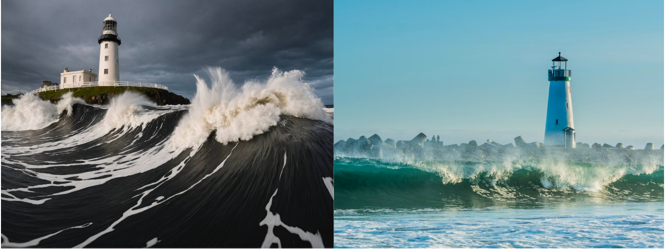
Fig. 1. Photo of a lighthouse generated by AI [3] on the left and a real photo on the right. As synthetic image generators improve, the near future will see synthetic images being generated that are visually indistinguishable from real images. Distinguishing between real and synthetic is going to be extremely important and existing infrastructure is not sufficient.