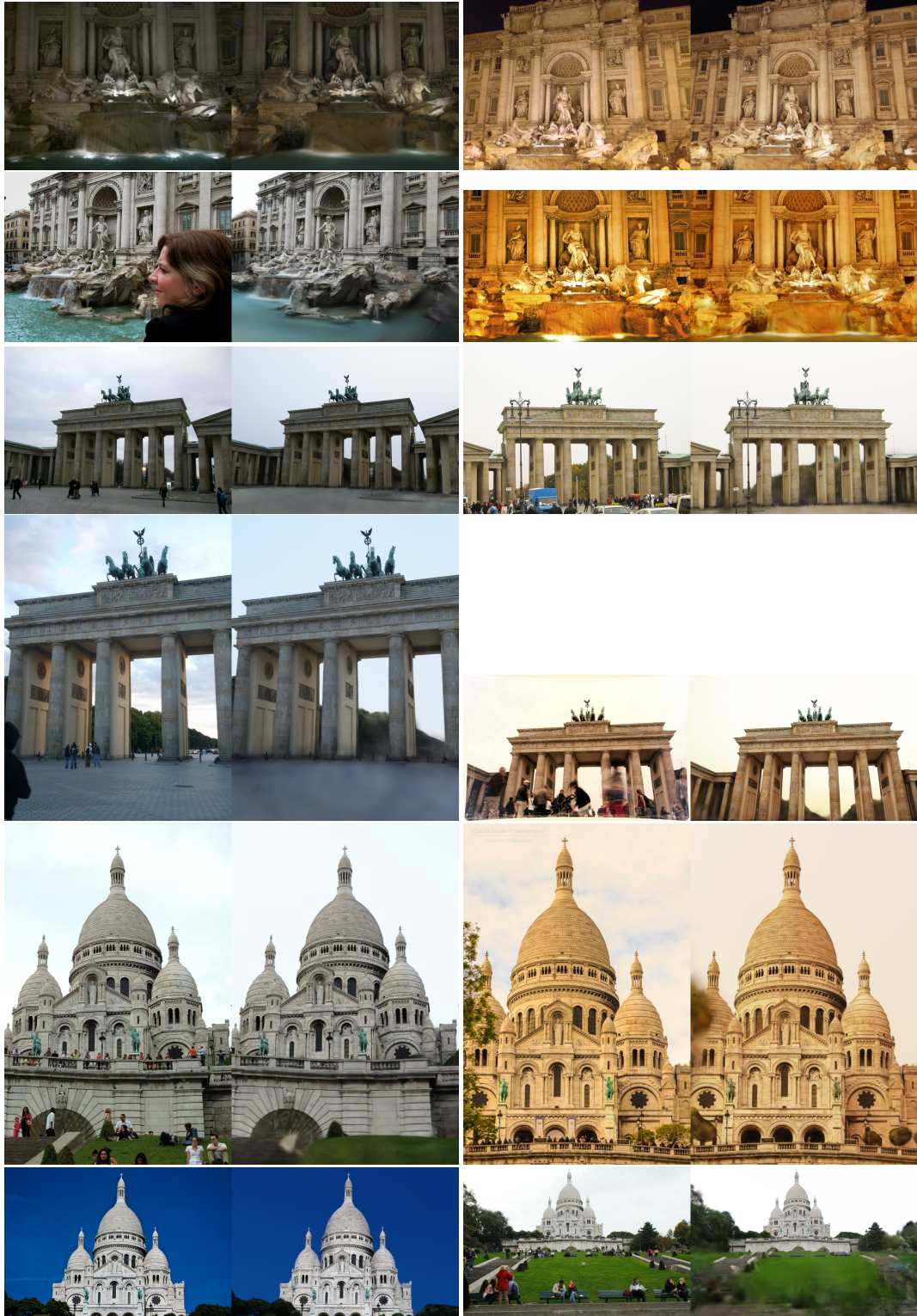
Figure 3. Eval Results for Trevi Fountain, Brandenburg Gate, and Sacre Coeur (Left: Ground Truth; Right: Splatfacto-W)