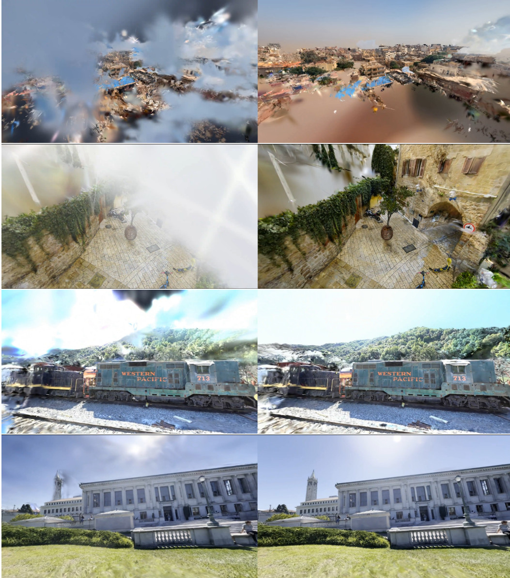
Figure 4. Background Modeling in Splatfacto (Left: Without Background Model; Right: With Background Model)