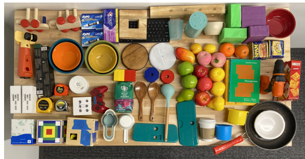
Fig. 2: Objects used for real-world evaluation.

We set up 20 scenes with a collection of 74 diverse objects, shown in Fig. 2. We ran both the EOS and RANDOM methods on each scene (the FINALFRAME method uses the same images as RANDOM, but a different method for generating a predicted segmentation). Although the replication of the scenes for the two runs was not perfect, we set them up as similarly as possible (comparing initial images as we did so). The robot carries out 3 actions in each scene.