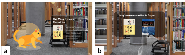
Figure 3: Participants' vision for future AR iterations. (a) a virtual cat is guiding users through information. (b) integrates AI-driven book recommendations.

5.2.3 Color-coded Virtual Tags. Feedback on the system's tagging feature was mixed. Some participants, like P5, found that "the tagging feature makes exploration easier," while others, such as P9, raised concerns about potential confusion. Additionally, participants expressed the need for tag categorization. P10 proposed having both "personal" and "public" tags, noting, "There are some tags I might want only for myself, like reminders, but for interesting books, I might want to recommend them to others."