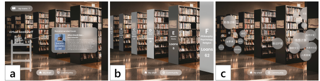
Figure 1: Low-fidelity prototype. (a) AR personal bookshelf. (b) Augmented bookshelves. (c) Comments bubble.

presenting customized book recommendations through an AR personal bookshelf. (2) Augmented Bookshelves. Overlays digital information on bookshelves, such as each category's book loan volumes. (3) Comments Bubble. Visualizes virtual comments from other readers as AR bubbles near relevant books, fostering a sense of community within the library.