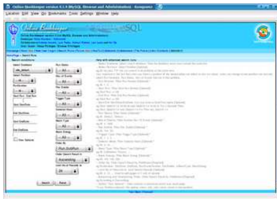
FIG. 2: OBK browser - search mechanism.

The latest version of the OBK browser includes several functionalities making it a powerful tool. It provides not only the functionalities of displaying the data coming from the OBK data acquisition process just after it was collected through the Online System but also the possibility of behaving like a Run Log Book. It was built with an excellent searching mechanism oriented to the final users which will be the Physicists.