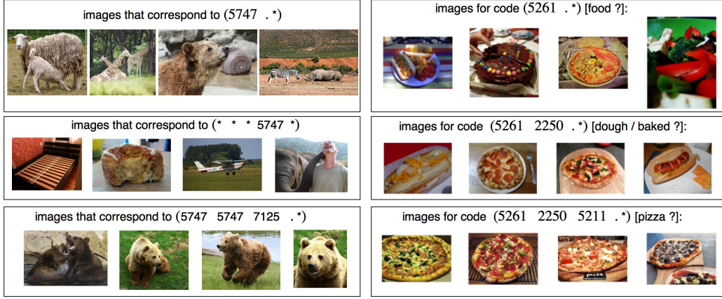
Figure 3: The samples from MS COCO that correspond to particular codes.

To better understand the nature of the learned language, we inspected a small subset of sentences that were produced by the model with maximum possible message length equal to 5. To avoid cherry picking images, we use the following strategy in both food and animal domains. First, we took a random photo of an object and generated a message. Then we iterated over the dataset and randomly selected images with messages that share prefixes of 1, 2 and 3 symbols with the given message. Figure 3 shows some samples from the MSCOCO 2014 validation set that correspond to (5747 * * *) code. 3 Images in this subset depict animals. On the other hand, it seems that images for (* * * 5747 *) code do not correspond to any predefined category. This suggests that word order is crucial in the developed language. Particularly, word 5747 on the first position encodes presence of an animal in the image. The same figure shows that message (5747 5747 7125 * *) corresponds to a particular type of bears. This suggests that the developed language implements some kind of hierarchical coding. This is interesting by itself because the model was not constrained explicitly to use any hierarchical encoding scheme. Presumably, this can help the model efficiently describe unseen images. Nevertheless, natural language uses other principles to ensure compositionality. The model shows similar behaviour for images in the food domain.