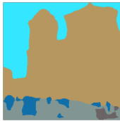
original image x