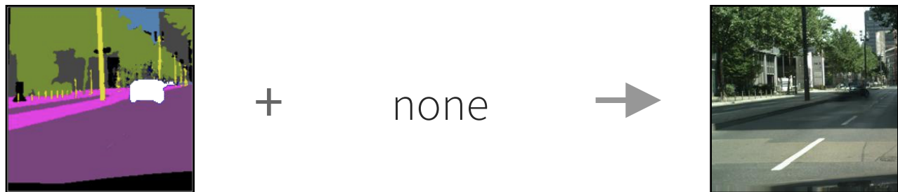
Precise object removal