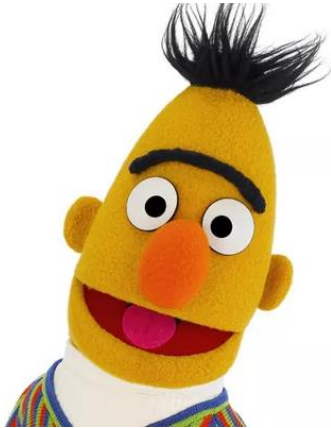
Pretrained Language Model