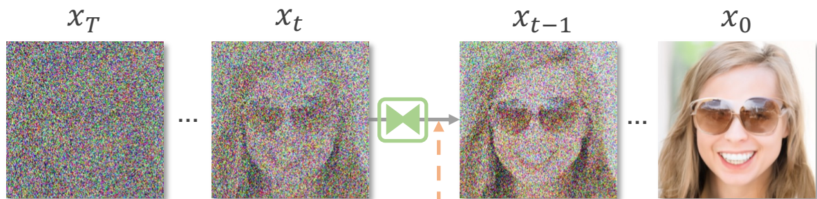
(a) Guidance Function Method