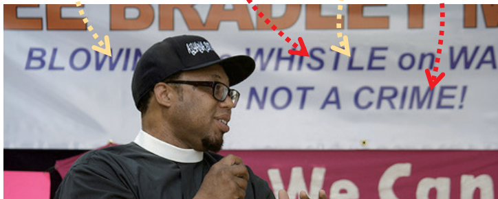
HR reference image