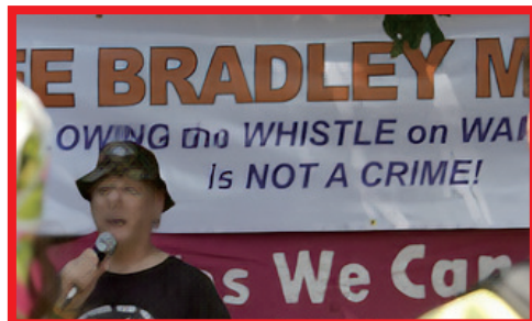
C^2 -Matching result