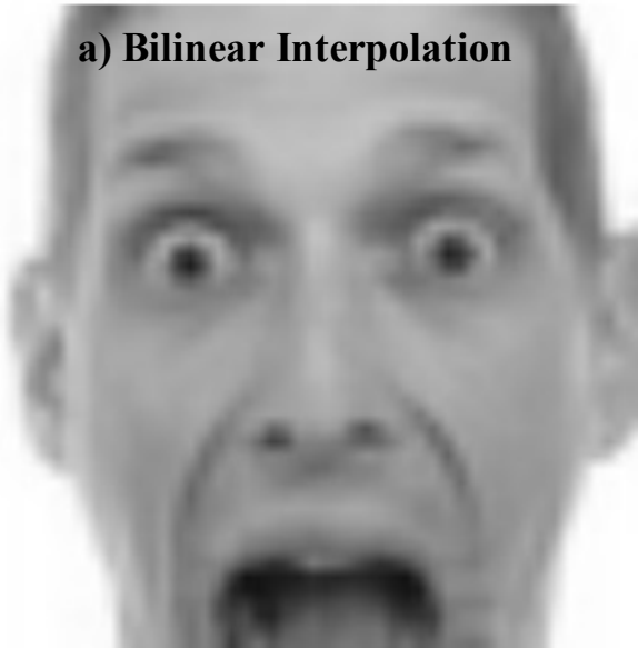
a) Bilinear Interpolation