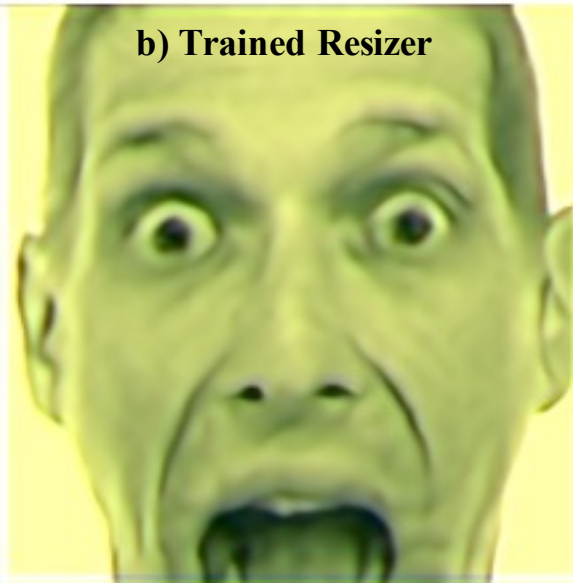
b) Trained Resizer