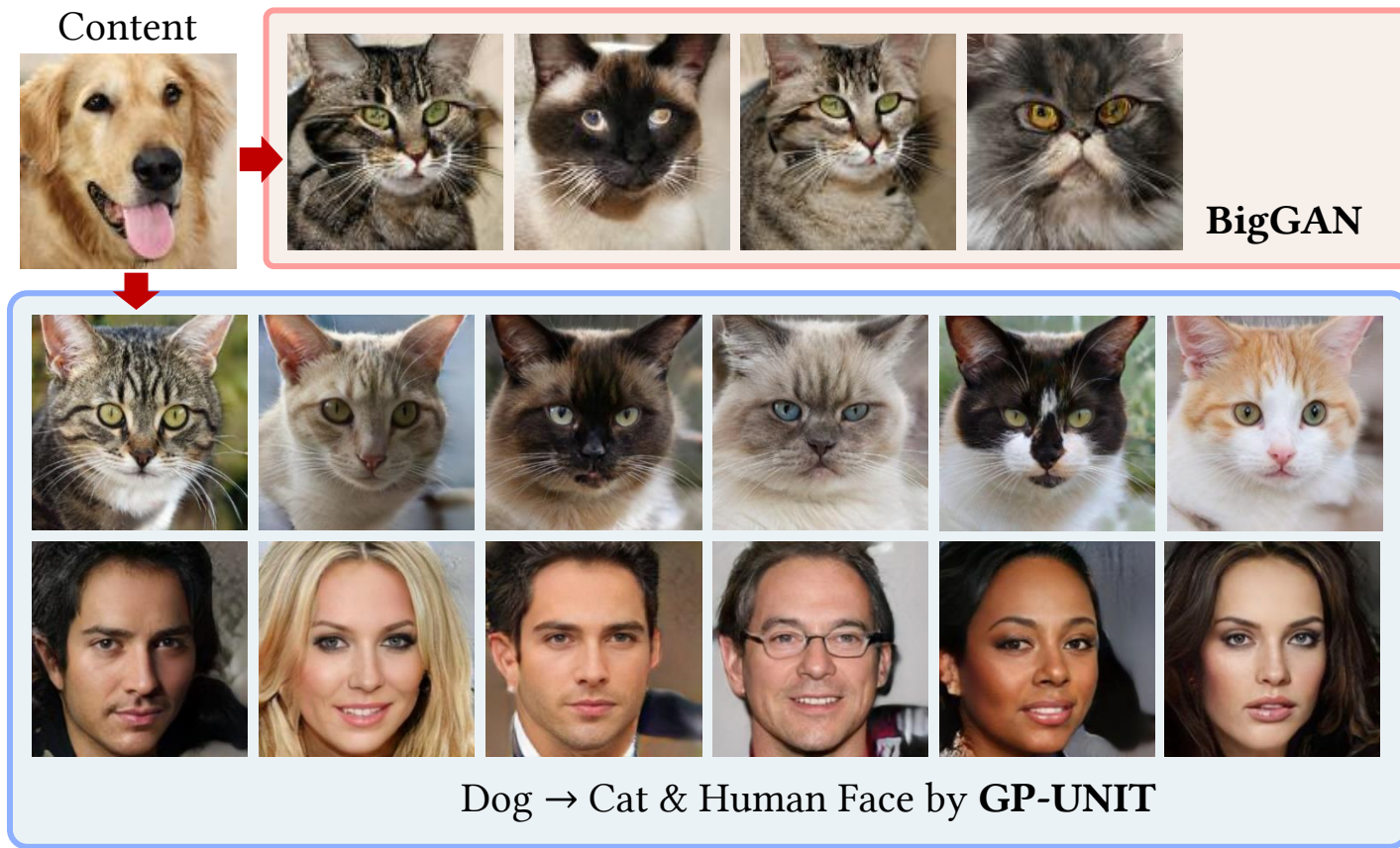
(b) translation to domains beyond BigGAN