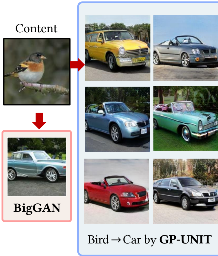
(a) multi-modal translation