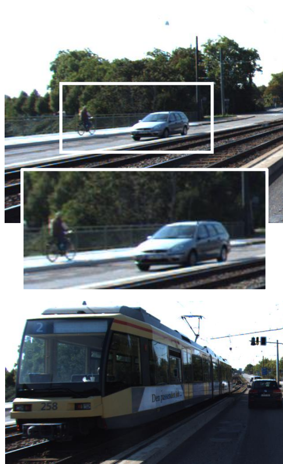
(a) Input image