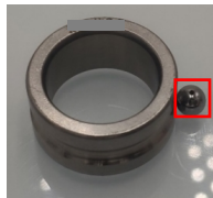
b) Inner race fault c) Outer race fault d) Ball fault