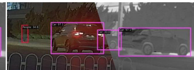
(h) EME (Ours)