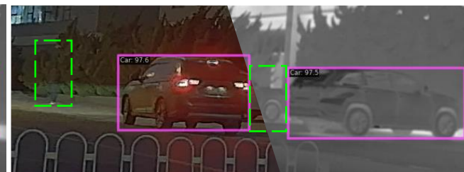
(g) Plain RGB-T Early Fusion