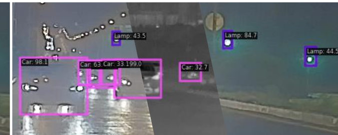
(d) EME (Ours)